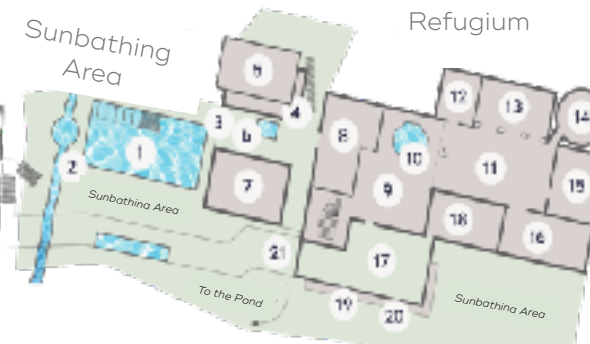
OUTDOOR SPA AREA & REFUGIUM